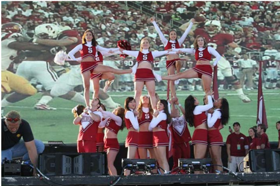
The Stanford University cheerleaders performed during the Gridiron Bash Pep Rally event, as did the cheerleaders from Virginia Tech.